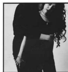
"Understand that sexuality is as wide as the sea. Understand that your sexuality is not law" derek jones