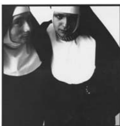
"Understand that sexuality is as wide as the sea. Understand that your sexuality is not law" derek jones