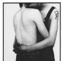
"Understand that sexuality is as wide as the sea. Understand that your sexuality is not law" derek jones