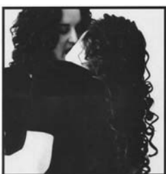
"Understand that sexuality is as wide as the sea. Understand that your sexuality is not law" derek jones